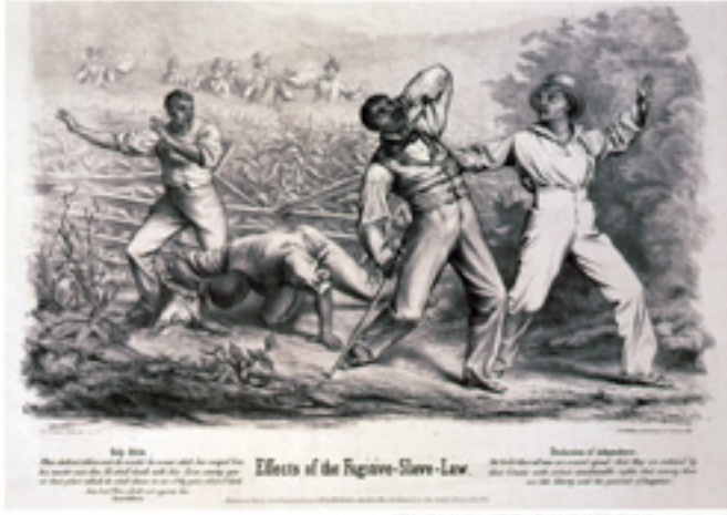
Effects of the Fugitive-Slave Law.