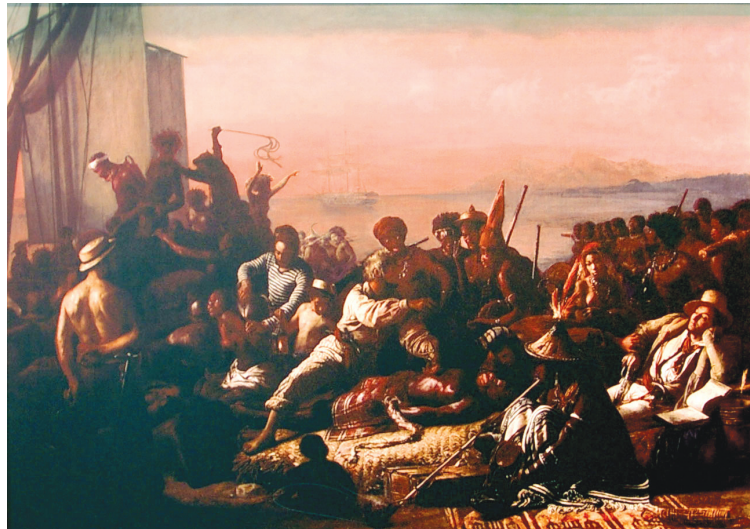
Artist's depiction of the slave trade

One day I was left alone at home with only my sister. All the others had gone out to work. Suddenly, two men and a woman got over the walls around our house and captured us both. They stuffed rags into our mouth and rushed us off into the woods before we could cry for help. Here they tied our hands and carried us until night. The next day, they made us walk for the whole day. Thus we continued to travel, sometimes on land and sometimes by water. We passed through many different countries and several nations. At the end of six or seven months after I was kidnapped, I arrived at the sea coast.