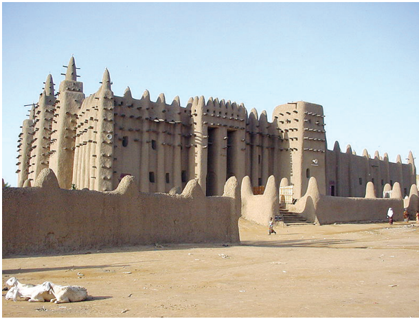
Mosque at Djenne, sister city to Timbuktu