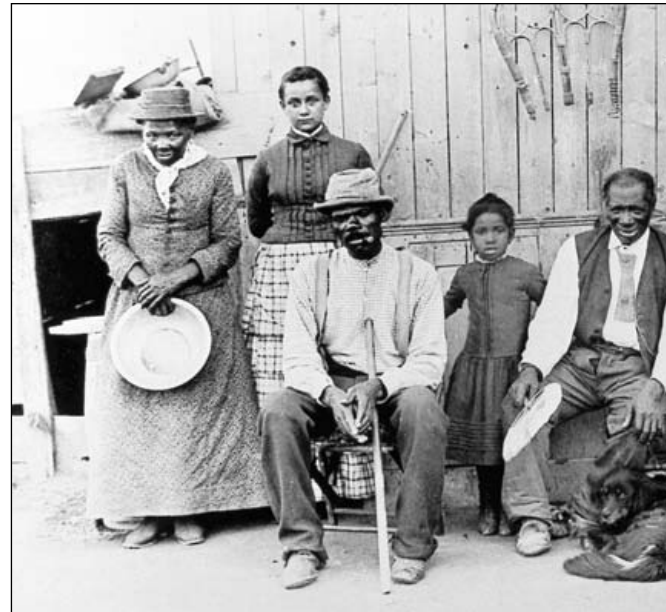
Harriet Tubman (far left) with a group of freed slaves. Ms. Tubman risked her life to lead more than 300 slaves to freedom in the North.

As a postscript (addition) to the story of abolition, it should be pointed out that not every escaped slave chose to travel along the Underground Railroad. Others devised means of their own. Perhaps the most ingenious was Henry “Box” Brown of Richmond, Virginia. Brown had friends nail him inside a wooden box marked THIS SIDE UP and ship him to antislavery sympathizers in Philadelphia. How’s that for creativity?