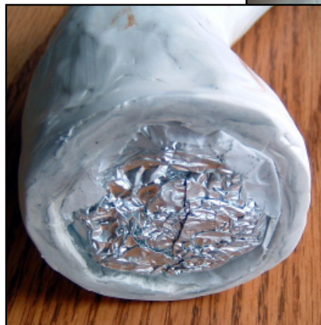
Bottom of horn