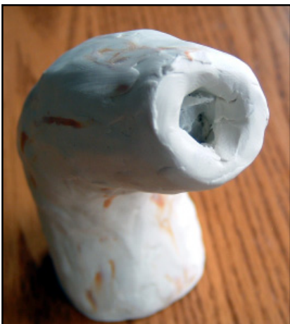
"Spout" of horn