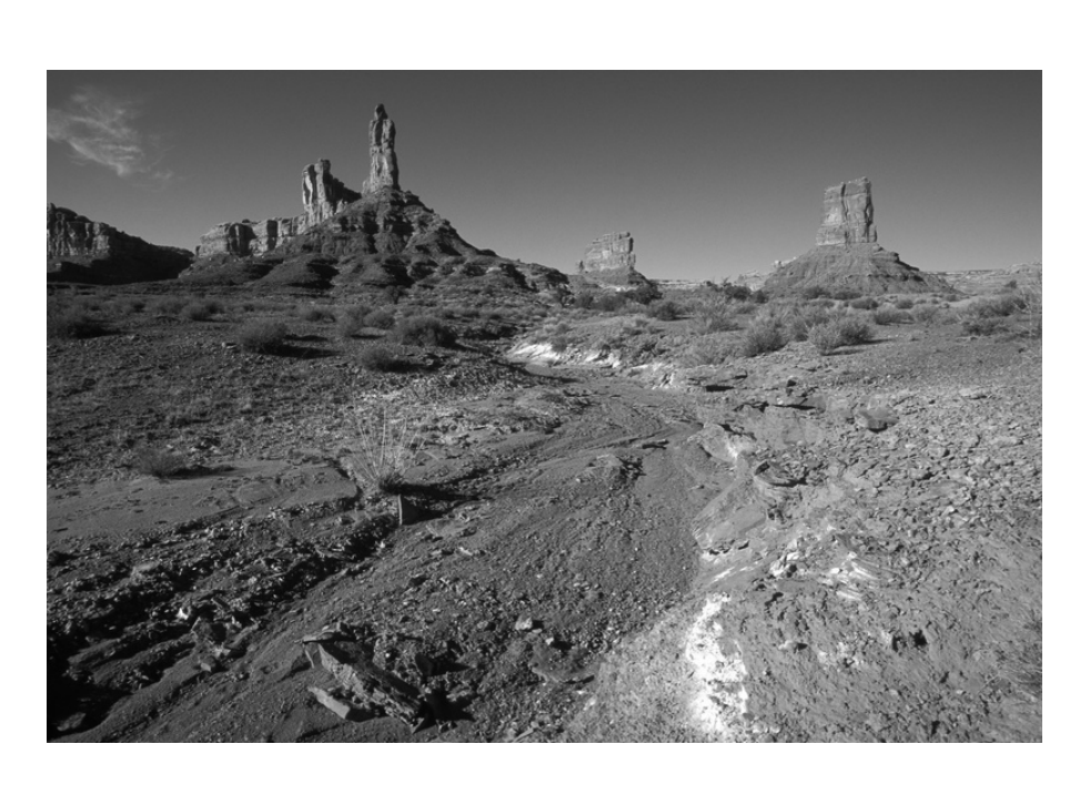
Social Studies School Service