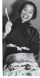
Zora Neale Hurston

The Harlem Renaissance was the name given by writer James Weldon Johnson to the flowering of African American art, literature and music that occurred in the 1920s and was based in Harlem. Langston Hughes and Claude McKay were two of many poets whose works often spoke about the African American experience. Zora Neale Hurston's novels focused primarily on the experience of African Americans in the South after slavery and Reconstruction ended. She also collected folklore from Jamaica and Haiti. The writers of the Harlem Renaissance brought the first critical attention to literature written by blacks. Their work helped disprove the stereotype of African Americans as limited intellectually and incapable of producing literature of worth.