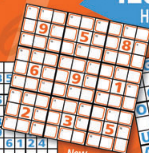
New Sudoku Sums